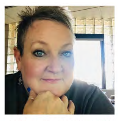
IN LOVING MEMORY